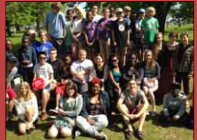
Youth Group BBQ