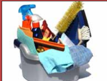
Cleaning Supply Drive p5